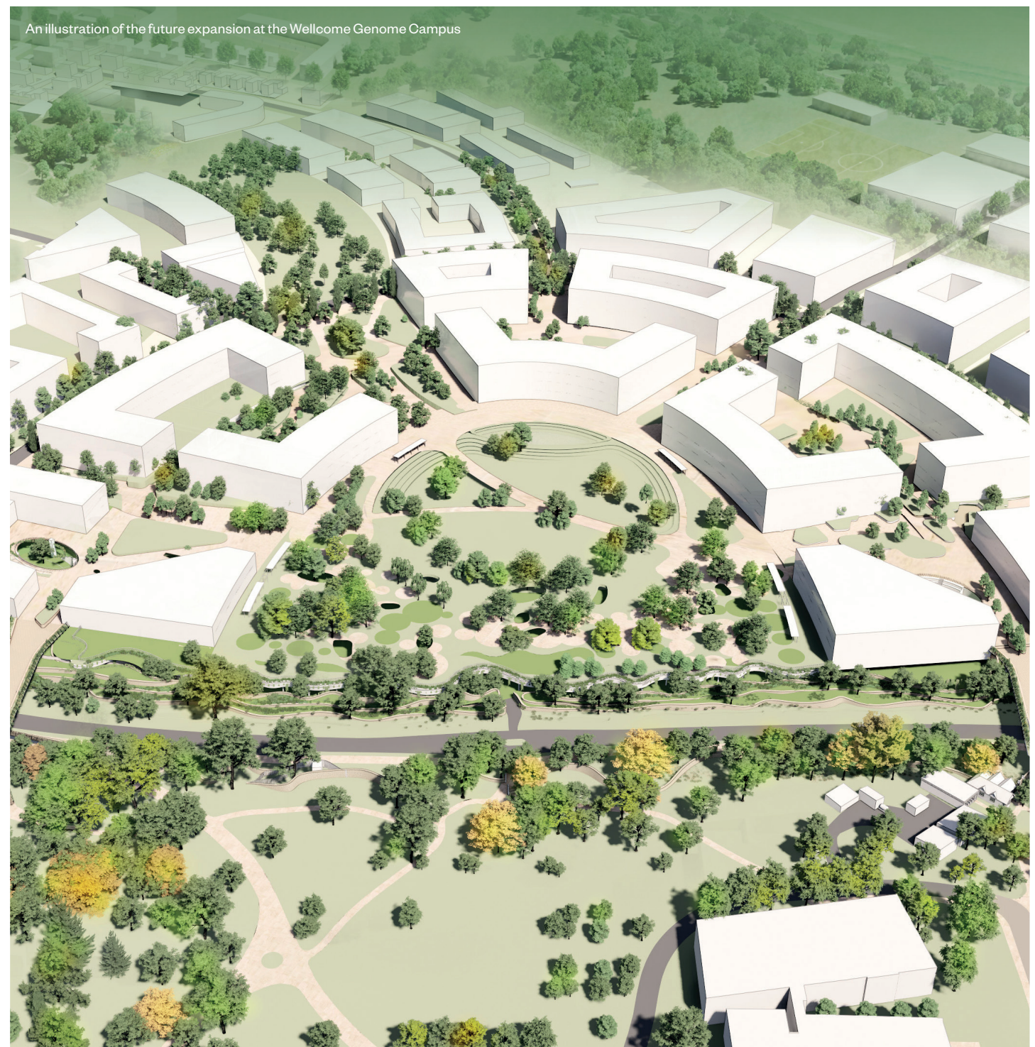
An illustration of the future expansion at the Wellcome Genome Campus