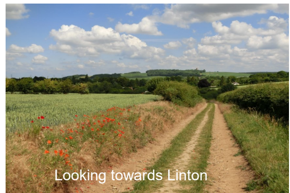
Looking towards Linton