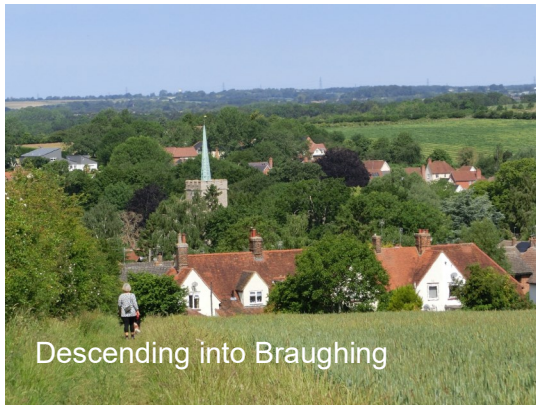
Descending into Braughing

All walk descriptions can be downloaded and