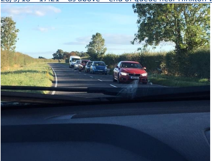
<u>16/10/18 – 17:53 – queue back to Hinxton Grange bend (64 cars) – cars turning on hazardous bend to avoid queue</u>