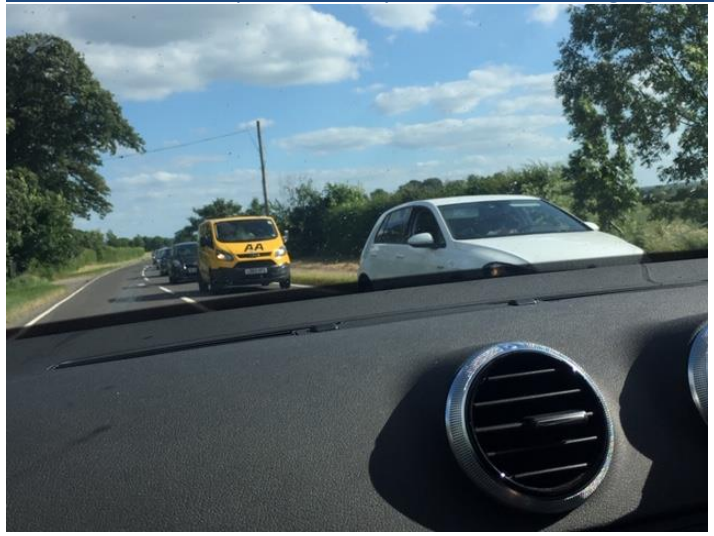
28/6/18 – 16:58 – queues to Hinxton Grange bend – c.80 cars