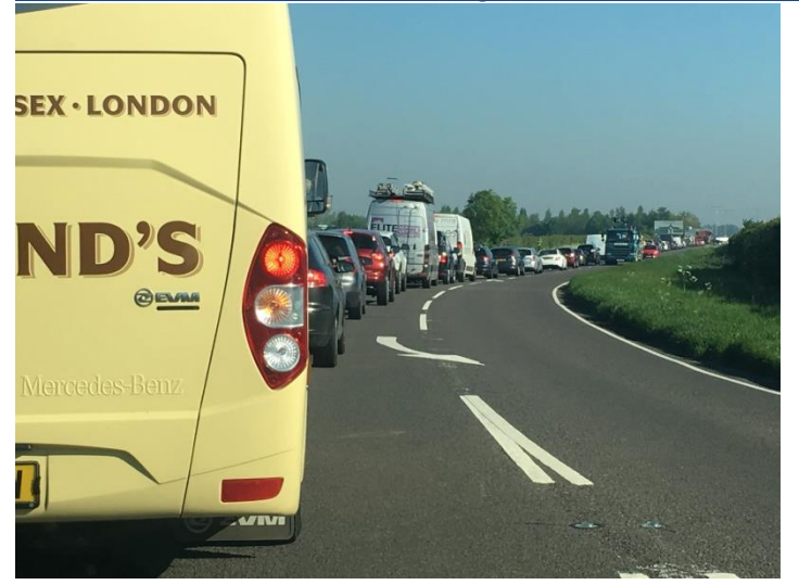
16/5/18 – 17:52 – queues to Hinxton Grange bend – c.50 cars

8/5/18 – 08:31 – as above – showing distance to roundabout