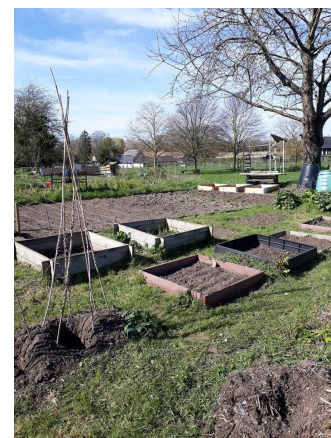
Allotments are ready to go